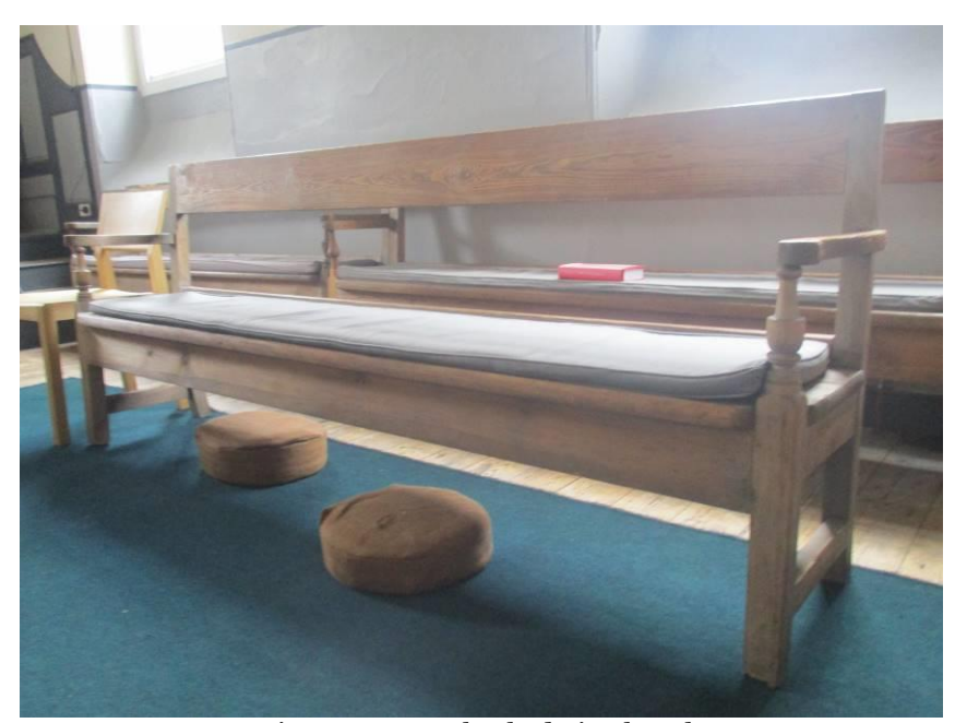
Figure 2: Open-backed pine bench

The seating consists of open-backed pine benches with turned front arm supports.